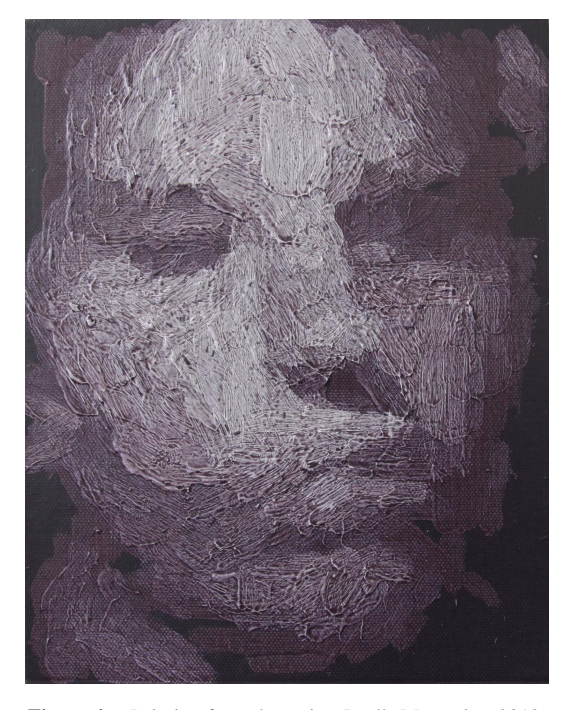
Figure 4. Painting from the series: Paul's Memories, 2013

Paul is designed to limit complexity, and only to fulfill its function, drawing. As such it is composed of a three-jointed planar arm with an extra joint to raise and lower the pen in contact with the paper and an actuated pan and tilt camera used as its eye. Both arm and eye are bolted to a single school desk where the drawing paper is attached using pins (fig.2).