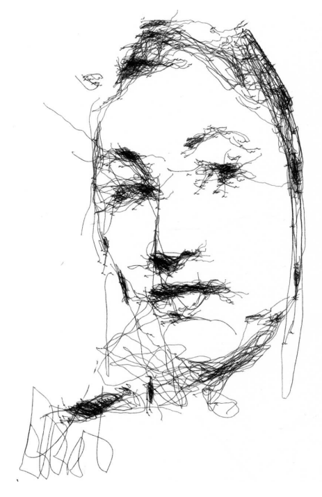
Figure 3. Sketch by Paul, 2011

As for the perceived agency of the system, studies have shown that humans have a tendency to consider robots as social agents, as having personalities and agency [3, 4]. It is likely that with the knowledge that an artwork has been produced by a robot, the observer will be able to consider the robot as the originator of the intentions that led to the artworks' creation, as the artist.